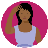
Persistent severe headache