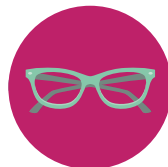
Blurred vision, seeing spots