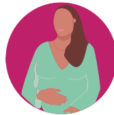
Contractions or cramps