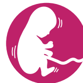
Baby's movements slow down or pattern changes