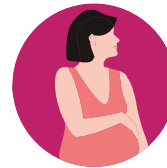
Sharp or continuing abdominal pain