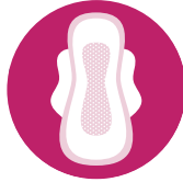
Spotting or light bleeding