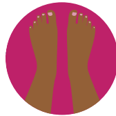
Swelling in face, hands or legs