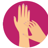
Itching, especially on hands and feet