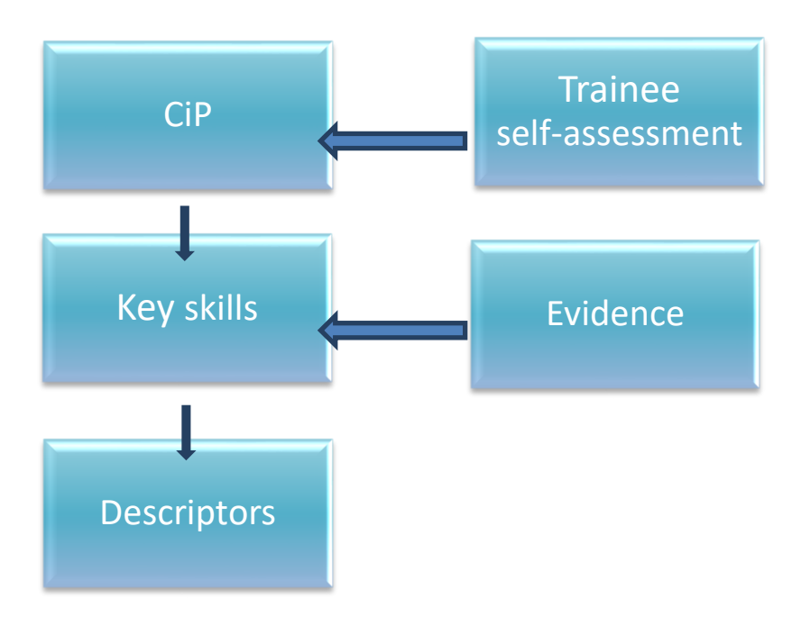
Figure 3 – Educational Supervisor's assessment of all CiPs